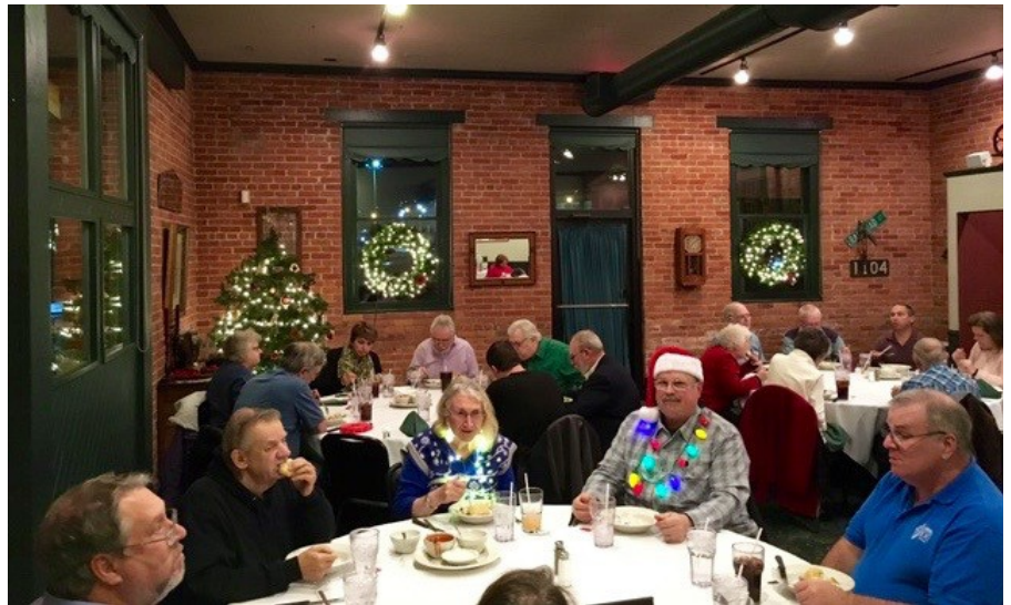
2017 Christmas Party