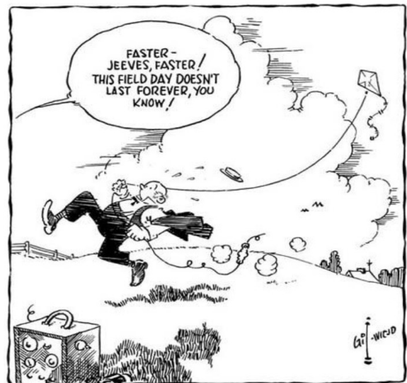
Classic Field Day cartoon by Philip "Gil" Gildersleeve, W1CJD