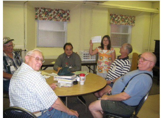
VE Sessions New YL