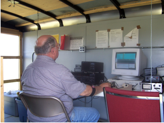
Field Day CW