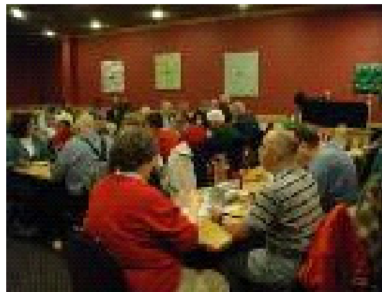
Christmas and FOOD