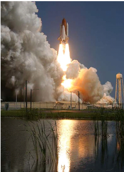
Hams go to Space AMSAT